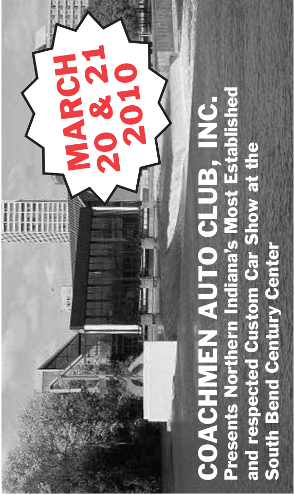
Exhibit Space Information and Reservation Form

COACHMEN AUTO CLUB, INC. 2110 N. MERRIFIELD AVE. MISHAWAKA, IN 46545